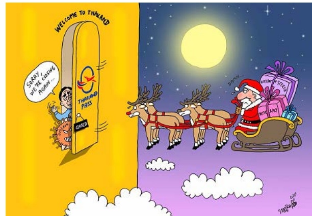
25th December 2021

本誌は不定期で発行する予定です。配信ご不要の方は、お手数をお掛けしますが、下記連絡先あてご連絡ください。