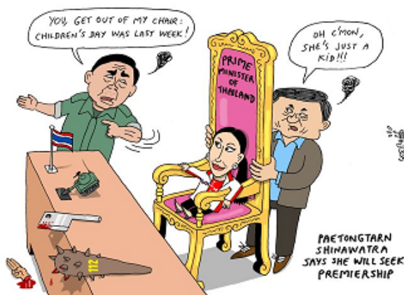
20th January 2023